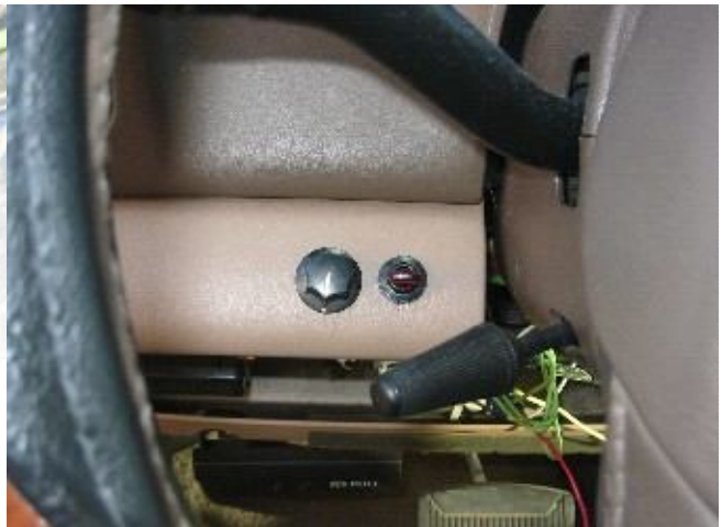
Dial (Figure 4)