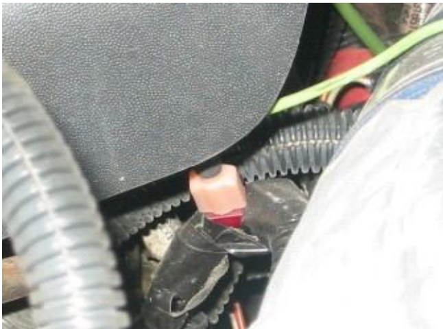
ICP Splice on BL/GR wire (Figure 3)