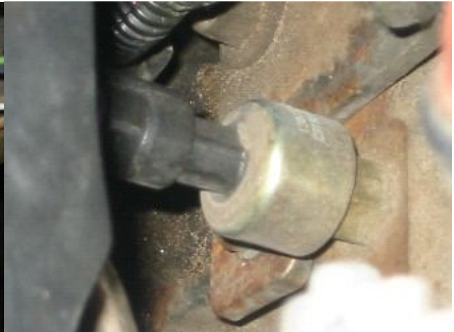
ICP (Figure 2)