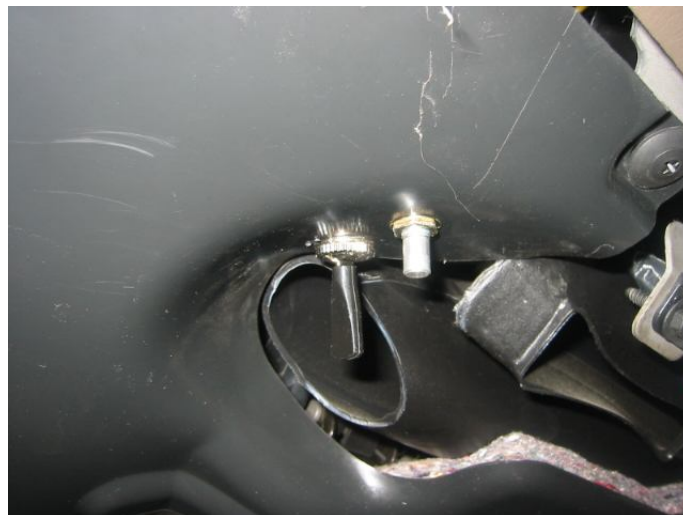
Mounting Location on bottom Panel for Excursion