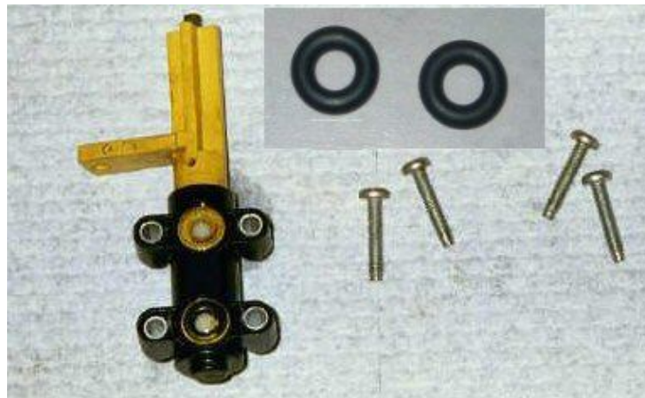
Fuel Filter Housing Drain Valve removed (New Rings on top)

Like any other products we cannot be held liable for incorrect installation. Installation of performance enhancing products is solely at your own risk. Check your local emissions laws prior to installation. Except in cases of gross negligence the buyer holds us harmless.