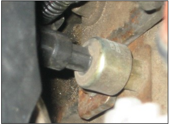
7.3L ICP (Figure 2)