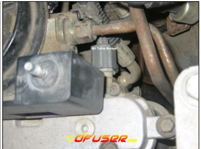
Oil Temp Sensor on Late 99-03 7.3L (Figure 10)