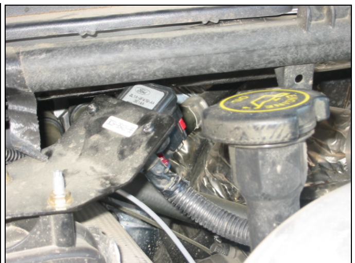
MAP Sensor location (Figure 6)