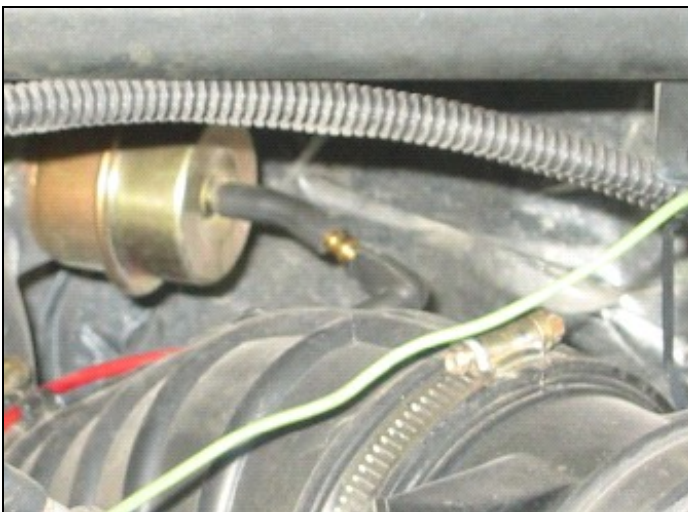
Boost Tube for 7.3L (Figure 5)