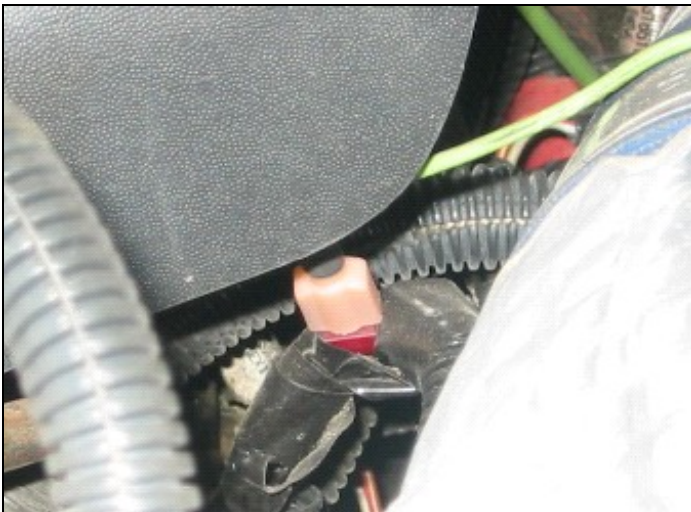
ICP Splice on BL/GR wire (Figure 3)