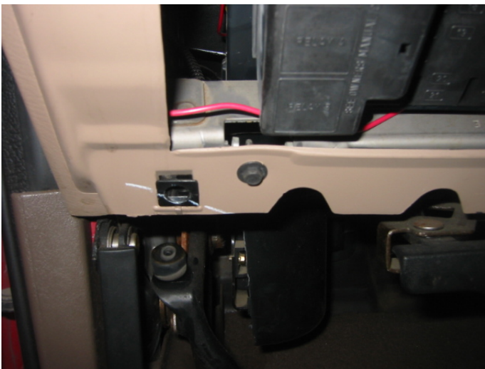
Ground location (Bolt)