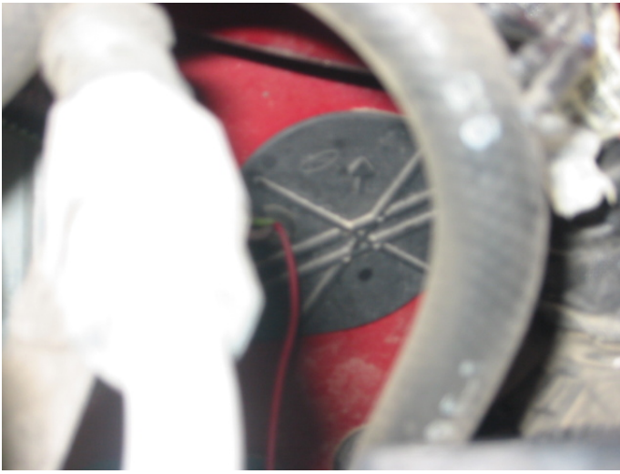
Access Panel (Auto Transmission Trucks Only)