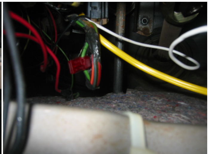
Brake Pedal Green Wire Tapped (Optional)

Note: The Ignition (+12V) red wire can be connected to the Brake pedal wire switch green wire. This option allows the module to only work when the Brake is applied and the Throttle pedal is off.